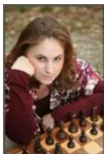
Judit Polgar (HUN)