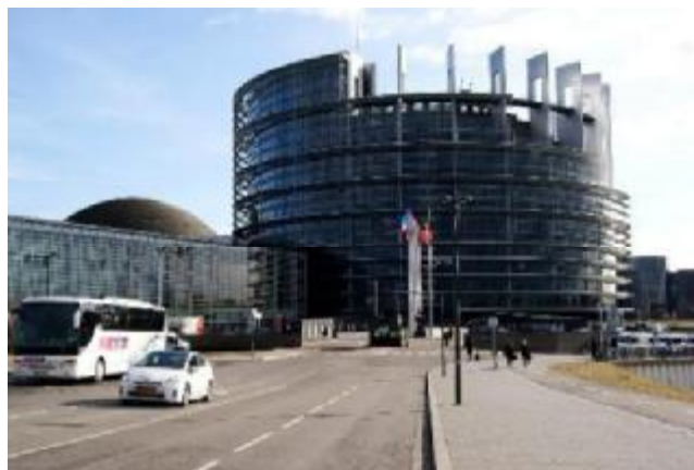
The European Parliament in Strasbourg, France

The Written Declaration will be officially communicated from the Parliament to the Commission and to the Parliament of each EU Member State together with the list of signatories.