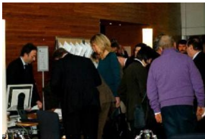
MEPs are signing the Written Declaration no. 50/2011

The President of the European Chess Union Silvio Danailov and the most legendary chess player Garry Kasparov arrived to Strasbourg to promote many educational benefits from the implementation of chess as an obligatory subject in the European schools. They participated in seminars dedicated to the program "Chess in school" and had many meetings with MEPs. Garry Kasparov played a simultaneous chess sessions against children and European deputies.