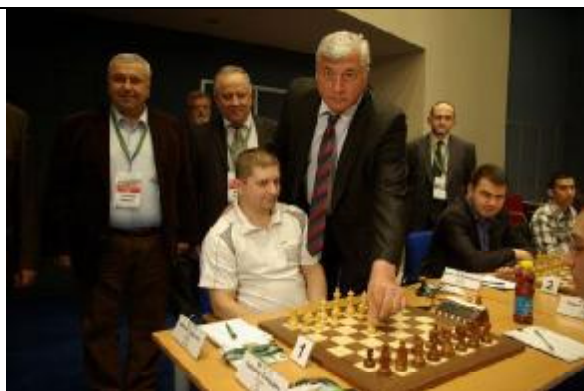
The first symbolic move made by the Governor of Plovdiv, Mr. Zdravko Dimitrov

The 13 th European Men's Individual Chess Championship has started on 19 th of March and will continue until 1 st of April, 2012 in Plovdiv, Bulgaria. The Championship is organized by the European Chess Union and the Bulgarian Chess Federation.