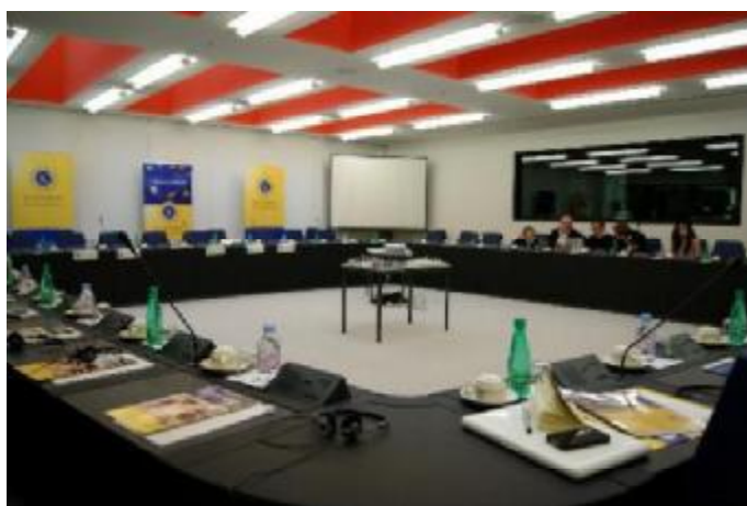
One of the two halls for the presentation of the project