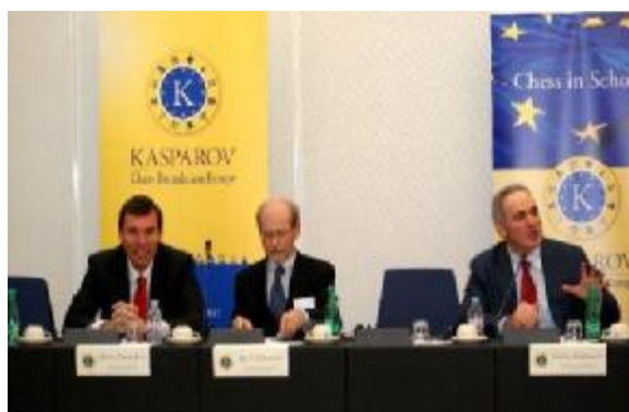
The presentation of the "Chess in school" project